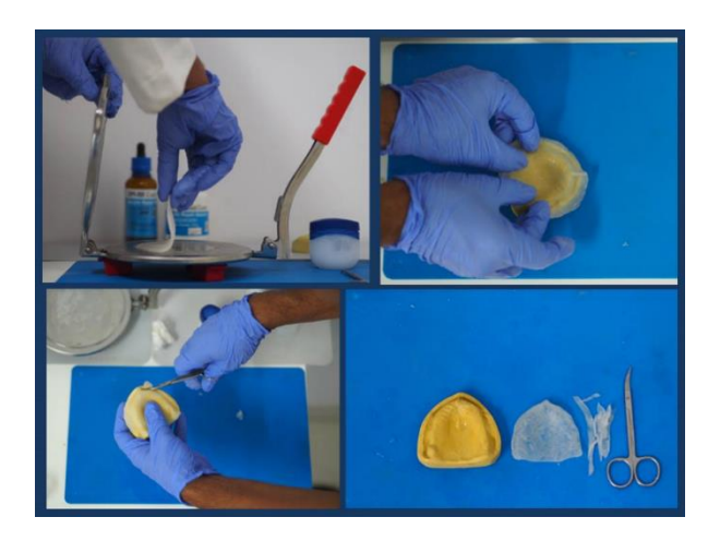
Fig 2: The sheet of polymer produced by the press is adapted to the cast and the excess cut away producing a denture base.